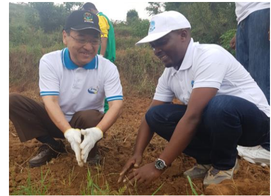
SDHA: Planting tree with HE Ambassador of Japan in Rwanda (Nov.2018)