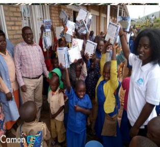
SDHA: Mobilization and education of young girls project