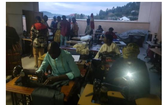
SDHA2019: Beneficiary-garment cooperative Muhanga